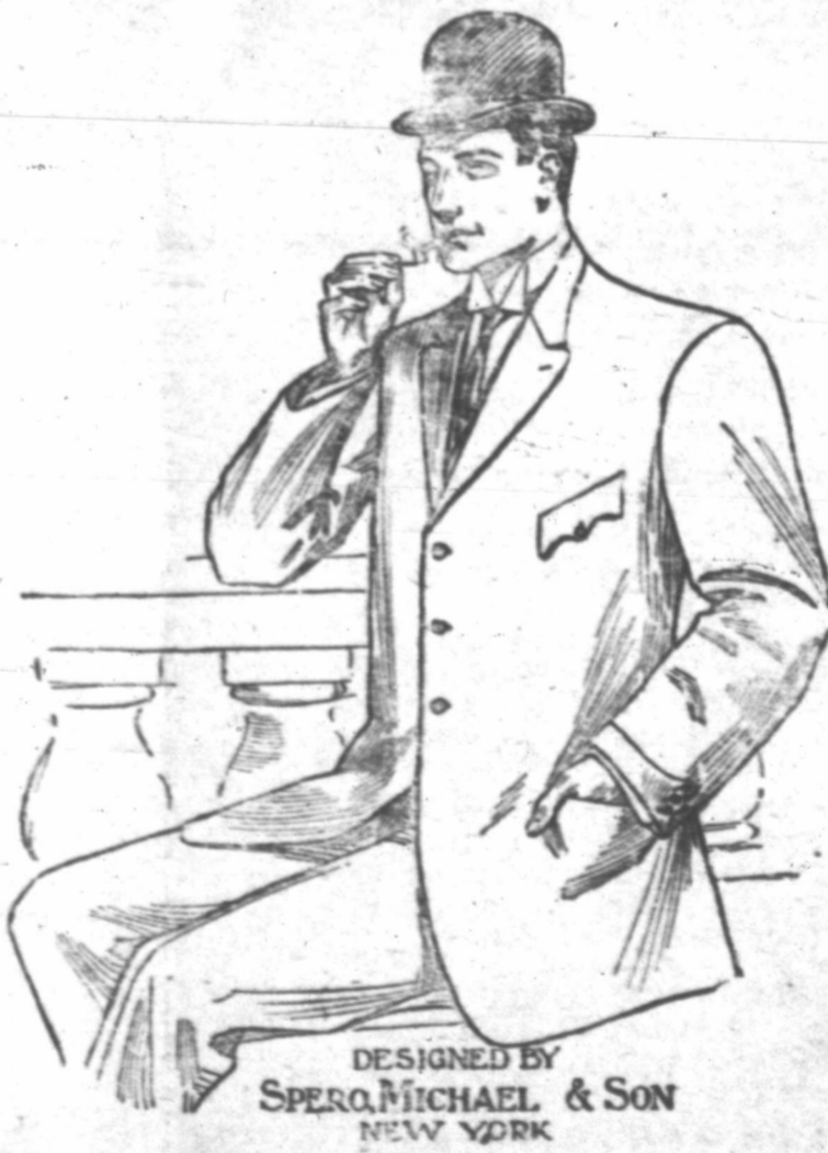
DESIGNED BY SPERO, MICHAEL & SON NEW YORK

This store is the home of the celebrated Hartt-Schaffner & Marx Clothing. We are now showing some beautiful patterns in the spring and summer lines. They will have to be seen to be appreciated. You are cordially invited to call and see the handsome, well tailored suits that are now on display. They are guaranteed to be all wool. Prices,