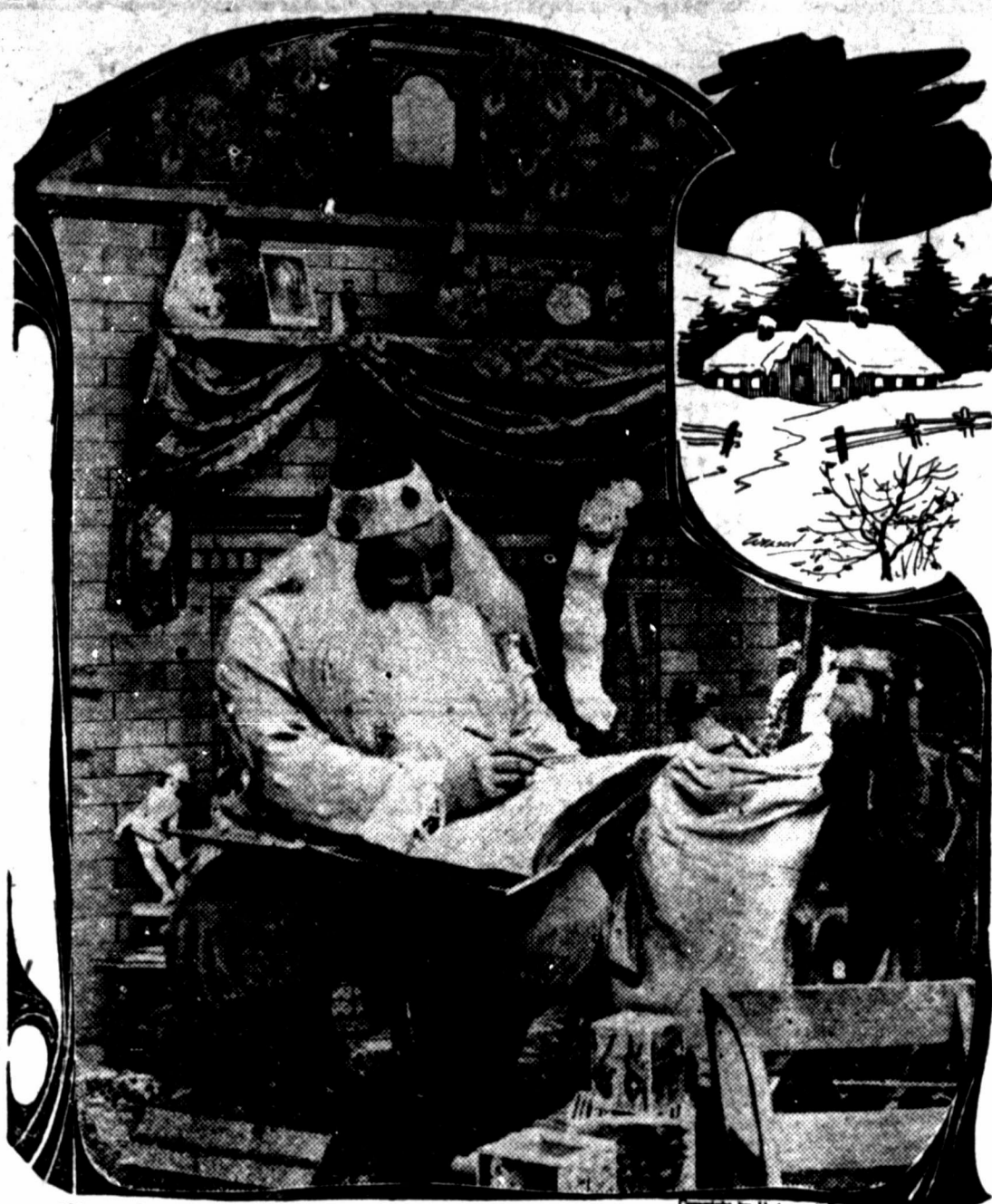
LOOKING UP THE CHILDREN'S RECORD