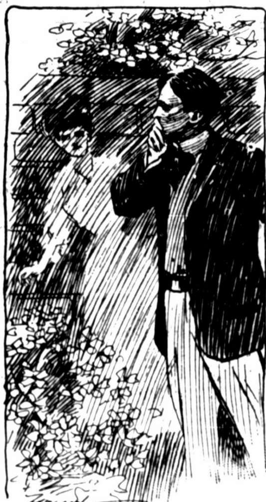
A Dim, Half-Shadowy Blur of White

Beneath the high wall in his garden, the Poet sat dreaming. He dreamed with his eyes upon a tiny. worn bit of paper that he held with protecting caress in the warm hollow of his palm. But now and again as the sweet scents and sound. and happy twitterings of the summer twilight came to him, he looked up smiling with heart and ever keenly alert and responsive, as is the way of poets when Nature calls to them. As the shadows in the garden deepened, however, so that the tiny square of white upon his palm was fast becoming a gray blur in the darkness, the Poet's eyes clung more lingeringly upon it. He bent over till the paper was within a few inches of his face, his lips