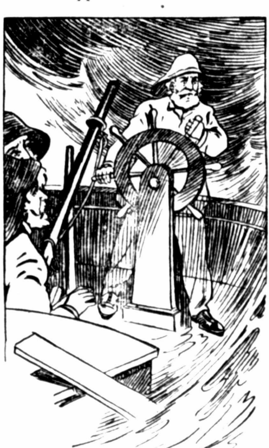
Wheel?" He Asked

wards the masts but said not a word. I understood him and ran forrard. The others were sailors, all, and they had already begun to bend a sail to the stump of the foremast so as to help the old hooker out of the pickle she was in.