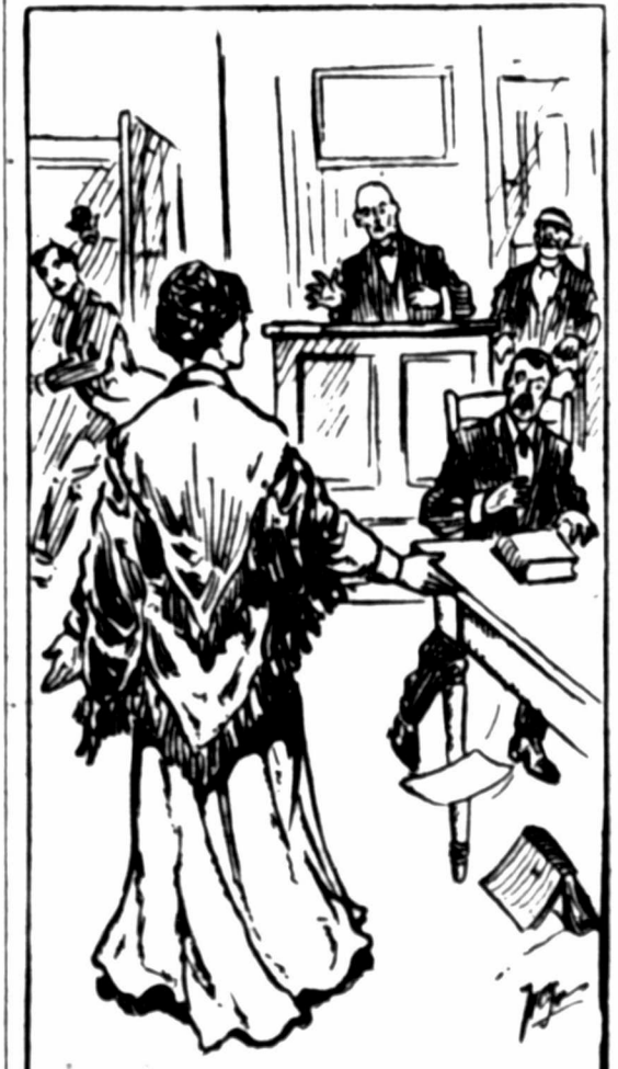
"We Got the Smallpox on the Children."

"I didn't come till you sent the officers, judge, 'cause I didn't know's