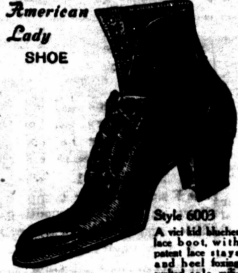
Style 6003 A vic kid leather lace boot with patent lace stays and heel facing which take military heel and patent toe.