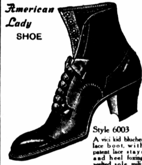
Style 6003 A nice kid blucher lace boot, with patent lace stays and heel facing welted sole, military heel and patent tip. "Vassar" Toe

We also invite your attention to our Dry Goods, Groceries, Notions, Hardware, Etc. We try our best to please you.