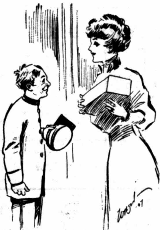
"They're from the Same Gent What Always Sends Them, Miss."

"I did some mighty hard thinkin' on the way to the office, and I was that sore at Montmorency that if I didn't weigh in the feather-