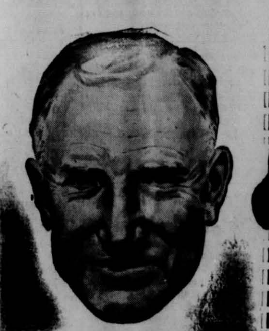
A FATHER Says

"My husband runs a grocery store and we're both going to vote November 7. I'll tend the store while he votes. My housework can wait that day. I'm going to vote because I feel that it's a precious privilege to be able to express my views at the ballot box. I want to share in helping make this a better country, where my children can be sure of a chance to work and get ahead... where there's freedom of opportunity. I want my children to live in the best country I can help to make. I think I'd be falling down on my duty as a mother if I didn't vote."