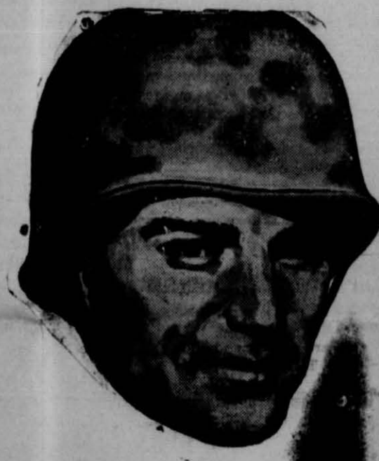
A SOLDIER Says

We're going to vote TUESDAY, NOVEMBER 7 Here's why: