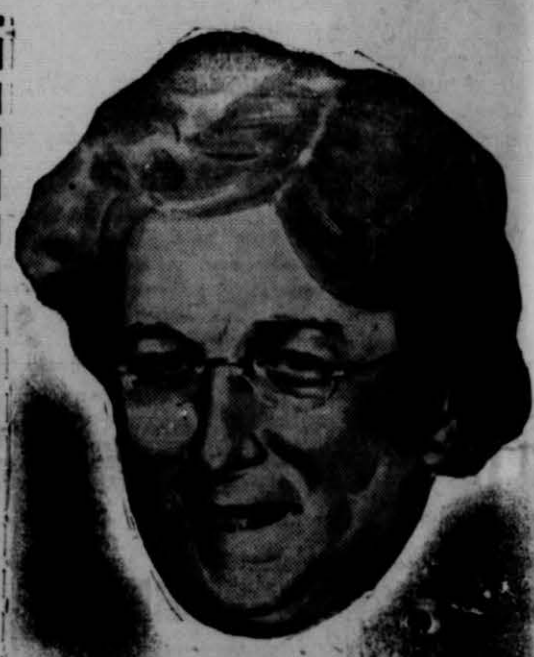
A MOTHER Says

"I'm fighting in a foreign country now, but I hope it won't be long till I can come home to my old job or a better one. I've seen people that have lost their freedom. I've seen what dictatorship can do... how men and women can be crushed when they lose their rights as free citizens. I'm fighting for a free America... a country that I can return to and enjoy the blessings of freedom. I've already sent my ballot home so my vote will count in helping to shape a country that will offset jobs and opportunity for all."