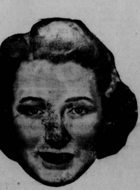
A WAR WIFE Says

"I'm a farmer and I'm going to be busy as usual on Election Day... but I'm not going to be too busy to go to the polls and vote. I'm too old to go across but I'm going to do everything I can to help hold on to our rights at home while my boy's fighting over there. There's nobody around trying to tell me how to vote... I don't need anybody. I'm going to vote for the men that I think will give us farmers equal opportunities with other people. I want my boys to have a chance after the war. You'll find my wife and me at the polls bright and early on November 7."