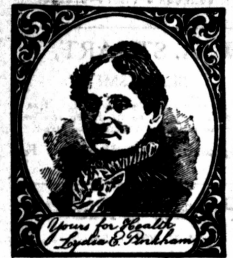
Yours for Health Lydia E. Pinkham

This remarkable woman, whose maiden name was Estlin, was born in Lynn, Mass., February 9th, 1819, coming from a good old Quaker family. For some years she taught school, and became known as a woman of an alert