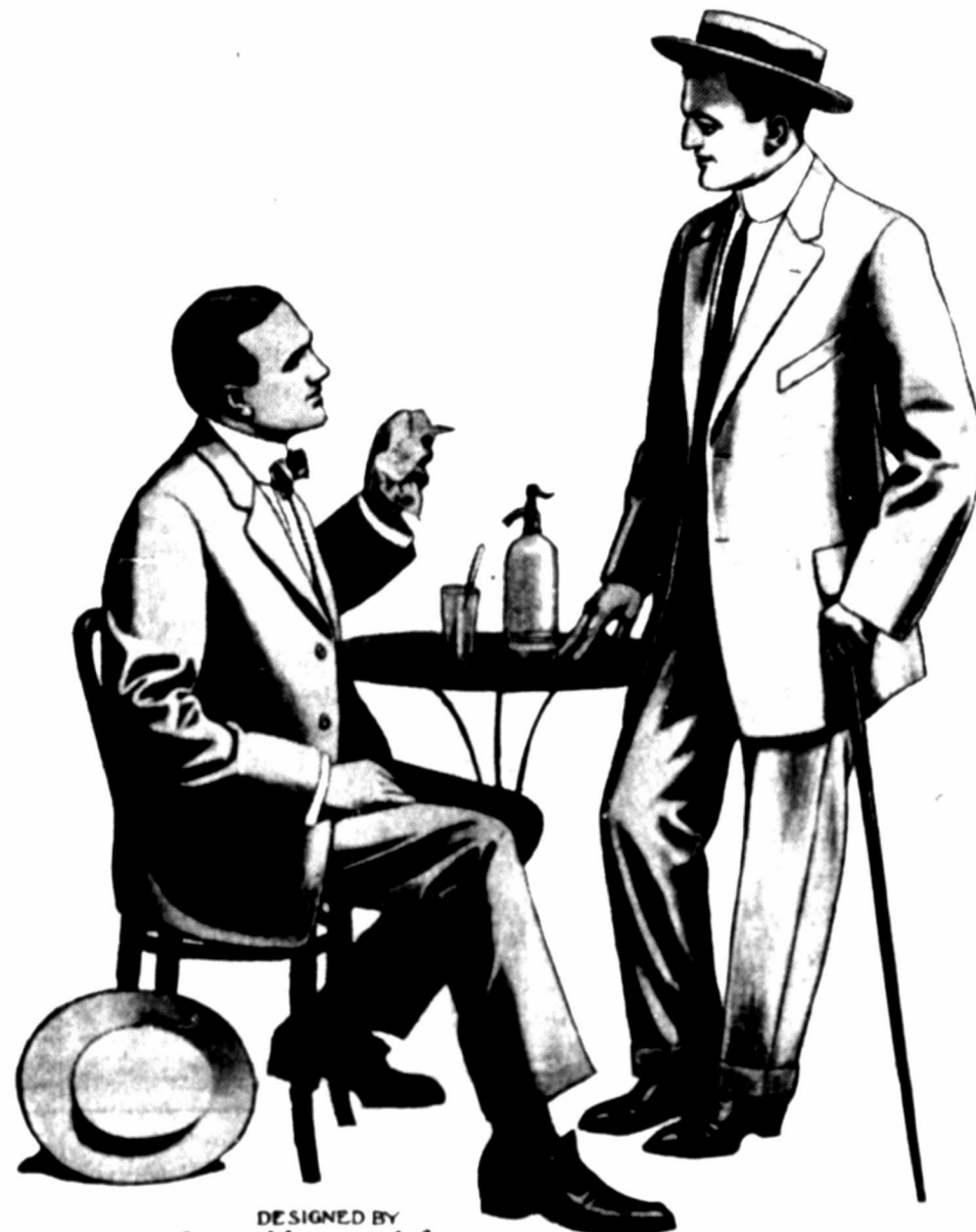
DESIGNED BY SPERO, MICHAEL & SON NEW YORK

Suppose you could get a $5.00 Skirt for $3.85, you'd be wise if you got it, wouldn't you? Well, you can get it but are you wise, that's the question? $5.00 Skirts, during this sale at $3.85