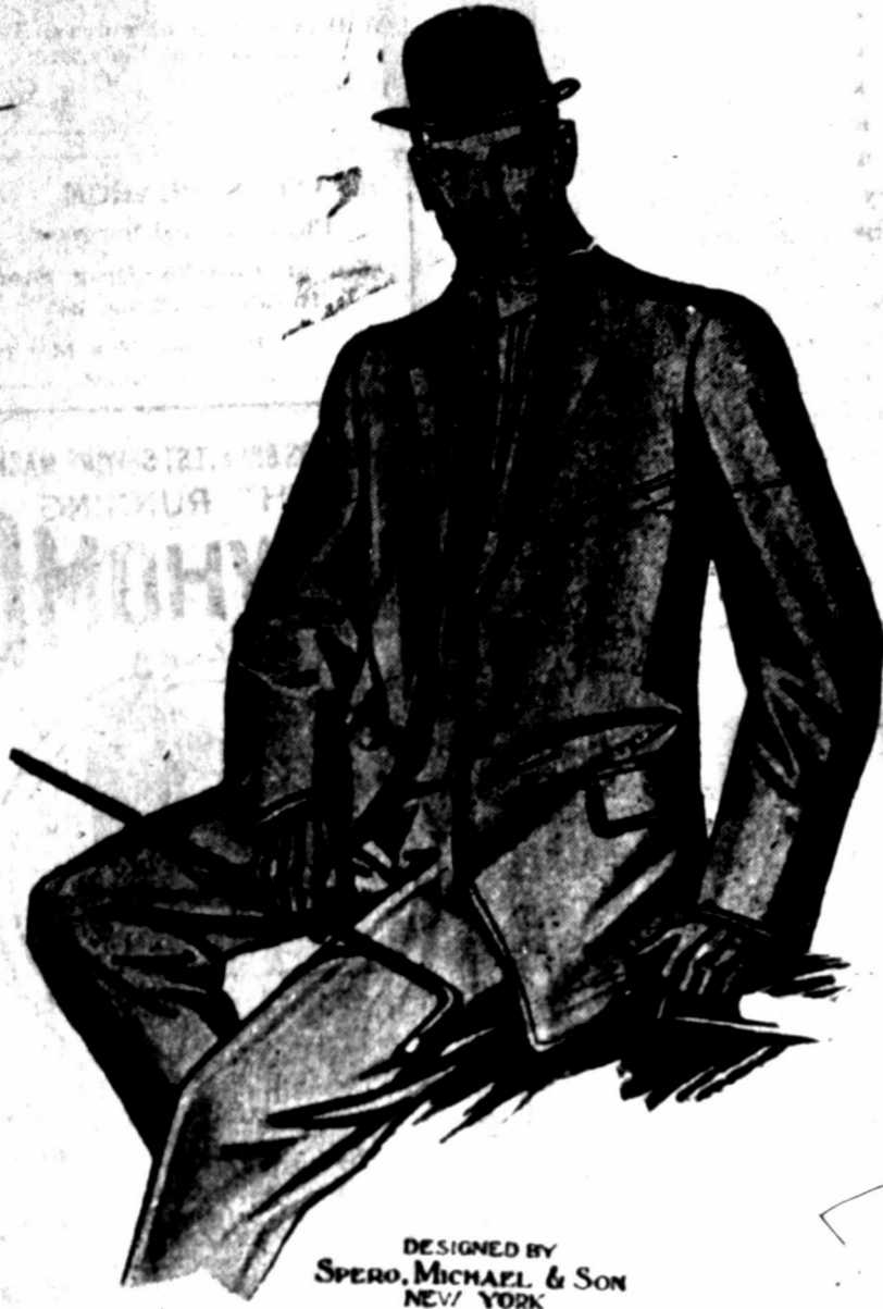
DESIGNED BY SPERO, MICHAEL & SON NEW YORK

H AVING just returned from the Eastern Markets where we bought the largest and most complete stock of nice new Spring Merchandise ever brought to Eastern New Mexico, and our new goods arriving every day, and in spite of the great advance in cotton goods we are selling most everything at the same old price. Also while in market we were able to pick up some RARE BARGAINS which we respectfully invite you one and all to come in and inspect, no matter whether you wish to buy just now or not. Please note the following leaders: