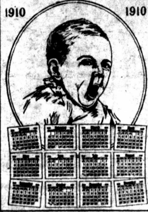
This Calendar Free to You!