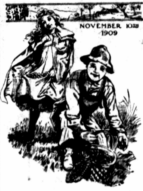
Farm and Fireside Free to You!

THE ROOSEVELT COUNTY HERALD has just concluded an extraordinary arrangement by which we can send you the new and greater Farm and Fireside, the greatest farm and home paper in America, absolutely without cost to yourself. Farm and Fireside comes twice every month, twenty-four big issues during the year.