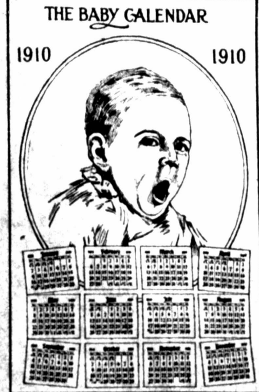
This Calandar Free to You!

The original painting of this Baby has excited more admiration and delight than any baby picture ever exhibited. It is truly wonderful. Every time you look at this sleepy boy you want to yawn, too. The calendar will be shipped to you carefully rolled in a tube, postage fully prepaid. Act today.