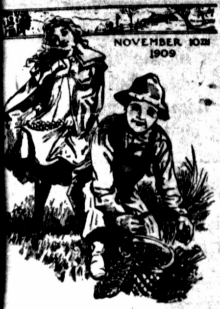
Farm and Fireside Free to You!

THE ROOSEVELT COUNTY HERALD has just concluded an extraordinary arrangement by which we can send you the new and greater Farm and Fireside, the greatest farm and home paper in America, absolutely without cost to yourself. Farm and Fireside comes twice every month, twenty-four big issues during the year.