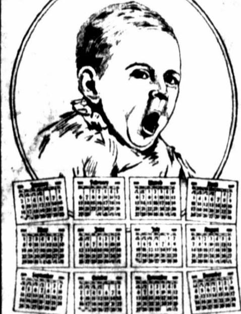
This Calendar Free to You!