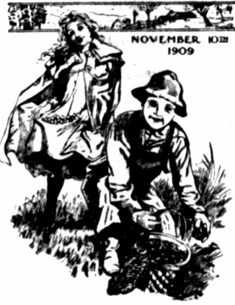
Farm and Fireside Free to You!

THE ROOSEVELT COUNTY HERALD has just concluded an extraordinary arrangement by which we can send you the new and greater Farm and Fireside, the greatest farm and home paper in America, absolutely without cost to yourself. Farm and Fireside comes twice every month, twenty-four big issues during the year.