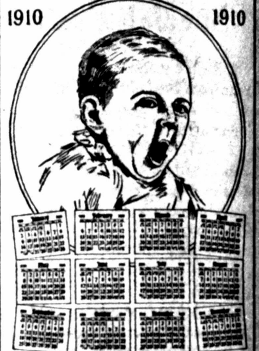
This Calendar Free to You!

OUR OFFER! For a short time only The Roosevelt County Herald makes you this great subscription offer. We will send you Farm and Fireside twice every month, for one year; we will also send you the Baby Calendar, carefully packed in a tube, postage prepaid, and we will send you The Roosevelt County Herald ALL FOR ONLY $1.00—the price of The Herald alone. This offer is unparalleled. It will shortly be withdrawn. You should act today.