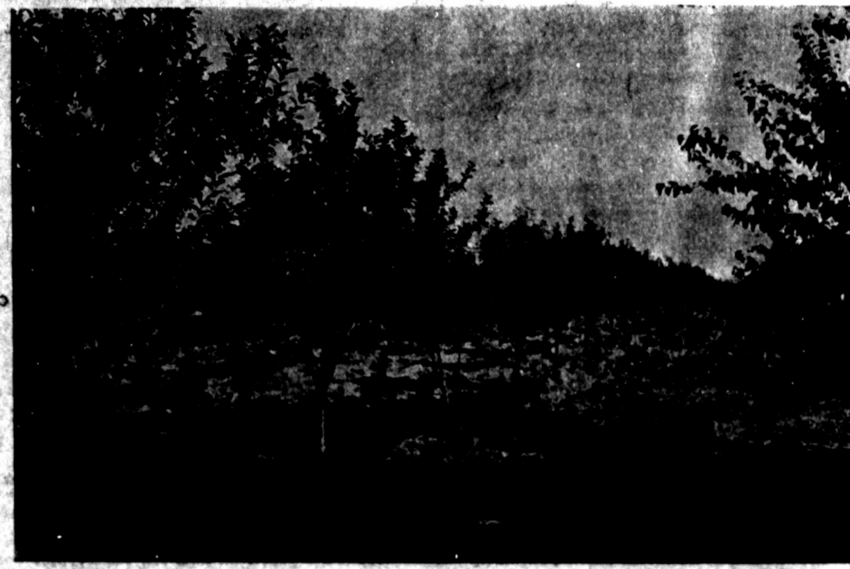
View of the 6 Year Old Humble Orchard Comprising 40 Acres, One of the Several Unique and Beautiful Features of Orchard Park

5 BEST BUSINESS OPENINGS: All kinds of New Enterprises will follow the Installation of Irrigation Plant. A chance now to buy a lot for a home and get in on ground floor of New Enterprises.