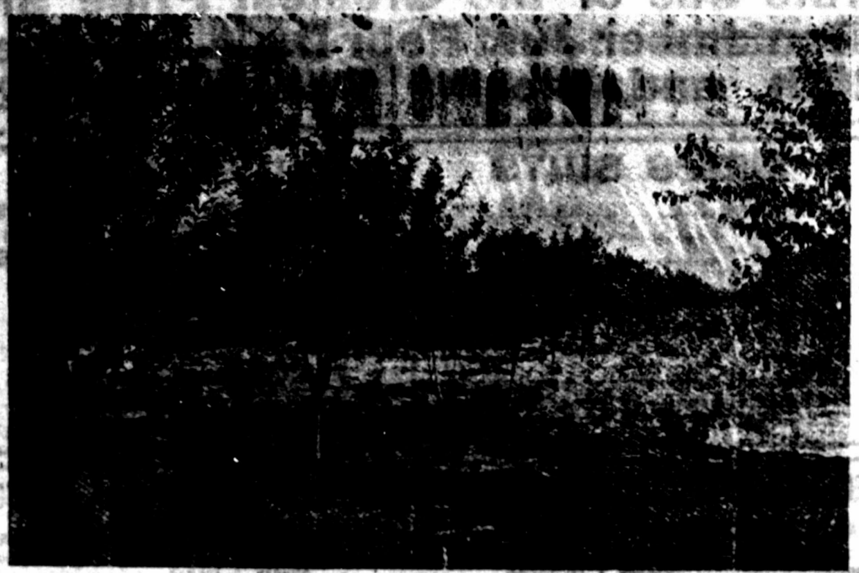
View of the 4 Year Old Humble Orchard Comprising 40 Acres, One of the Several Unique and Beautiful Features of Orchard Park

5 BEST BUSINESS OPENINGS: All kinds of New Enterprises will follow the Installation of Irrigation Plant. A chance now to buy a lot for a home and get in on ground floor of New Enterprises.