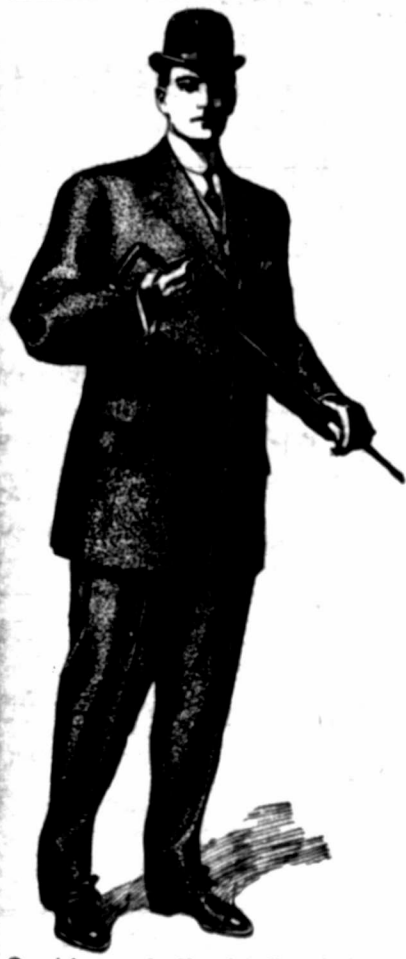
Copyright 1909 by Hart Schaffner & Marx

Be Sure and See the Skirts We are Selling at $3.98.