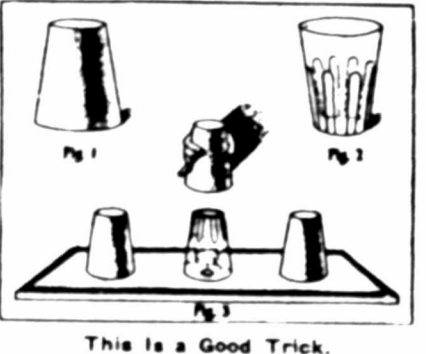
This is a Good Trick.