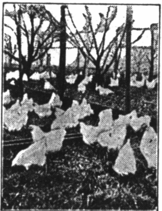
Provide Plenty of Winter Succulence for the Flock.

If the best results are to be obtained with poultry they must be furnished with a plentiful supply of green feed. Where fowls have unlimited range on a farm they will secure green feed during the spring, but during the winter it must be supplied for them. The question of how to supply the best feed at the least cost is one that each poultry keeper must decide largely for himself. It will probably make but little difference what kind of green feed is supplied, provided it is relished by the fowls. Cabbages, turnips, beets, potatoes, etc., are suitable for this purpose. The larger roots and the cabbages may be suspended by means of a wire or string, or they may be placed on the floor, in which