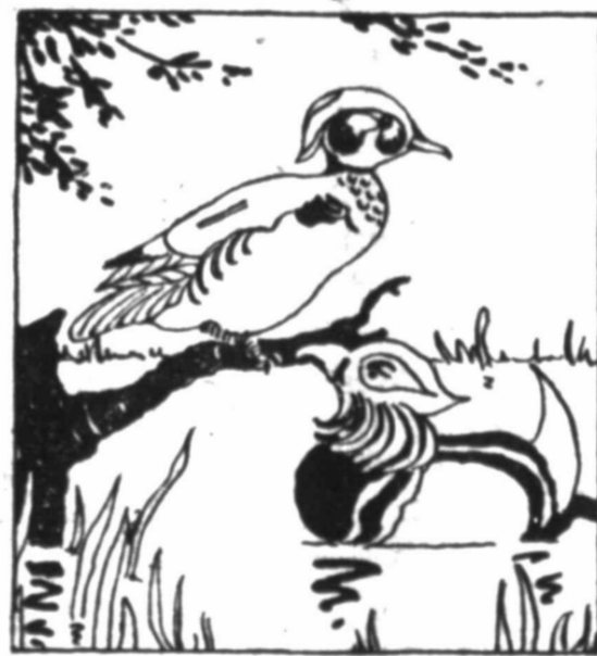
It's Nice to Meet You.

Masonic records of the early presidents are not complete. The following presidents are listed as Masons: Washington, Adams, Jefferson, Madison, Monroe, John Quincy Adams, Jackson, Harrison, Tyler, Polk, Taylor, Pierce, Buchanan, Johnson, Garfield, Arthur, Cleveland, McKinley, Roosevelt and Taft.