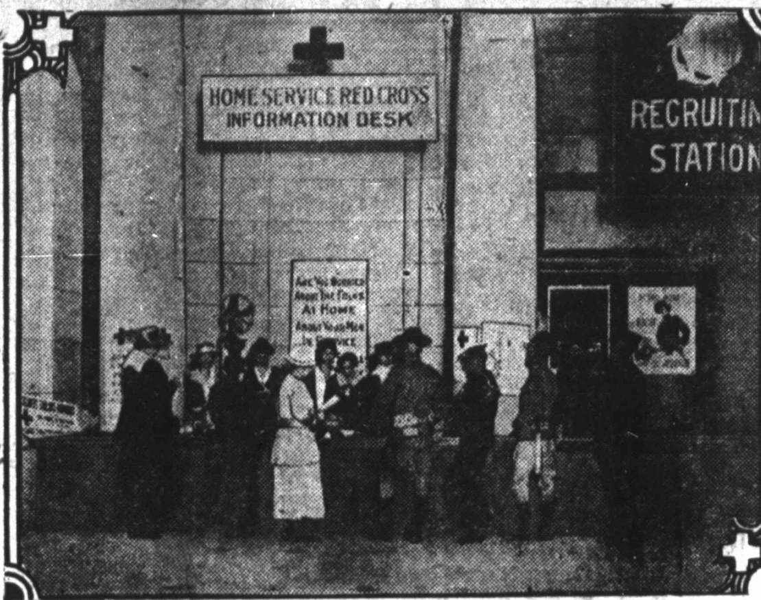
One of the finest constructive activities of the American Red Cross in the war was Home Service in the United States, the friendly connecting link between the soldier far from home and his loved ones. This branch of the work which under the peace program of the Red Cross will be expanded, to benefit all who need the assistance it can provide, is directed by scientifically trained social workers. Since instituted Home Service has assisted 800,000 soldiers' and sailors' families. This photograph shows one of the innumerable Home Service information bureaus where service men and their families could bring their problems for solution.

make the present drive a strong one, and to supply the necessary amount of money for this purpose.