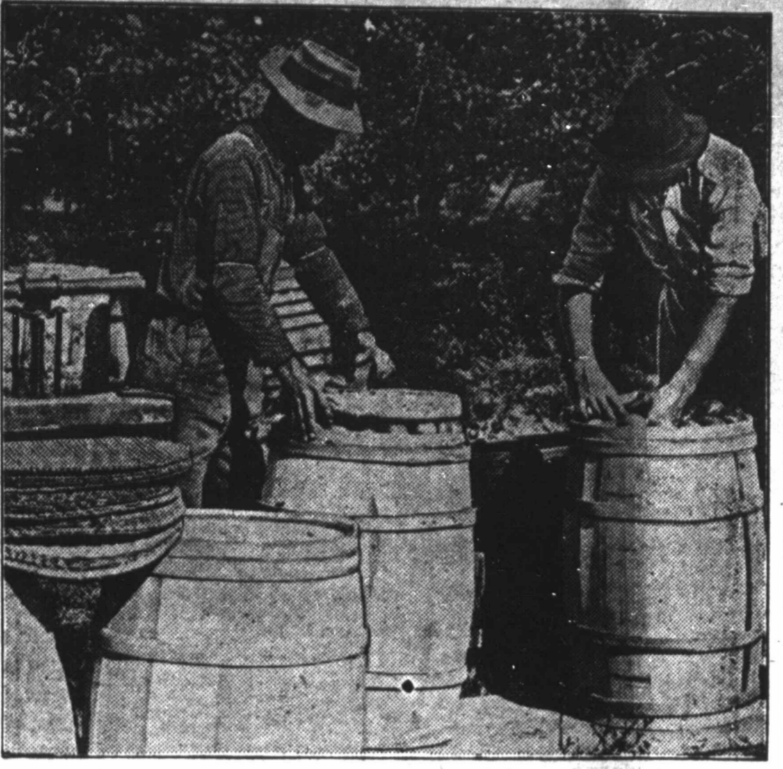
Preparing Apples for Market—Packing in Barrels.

(Prepared by the United States Department of Agriculture.)