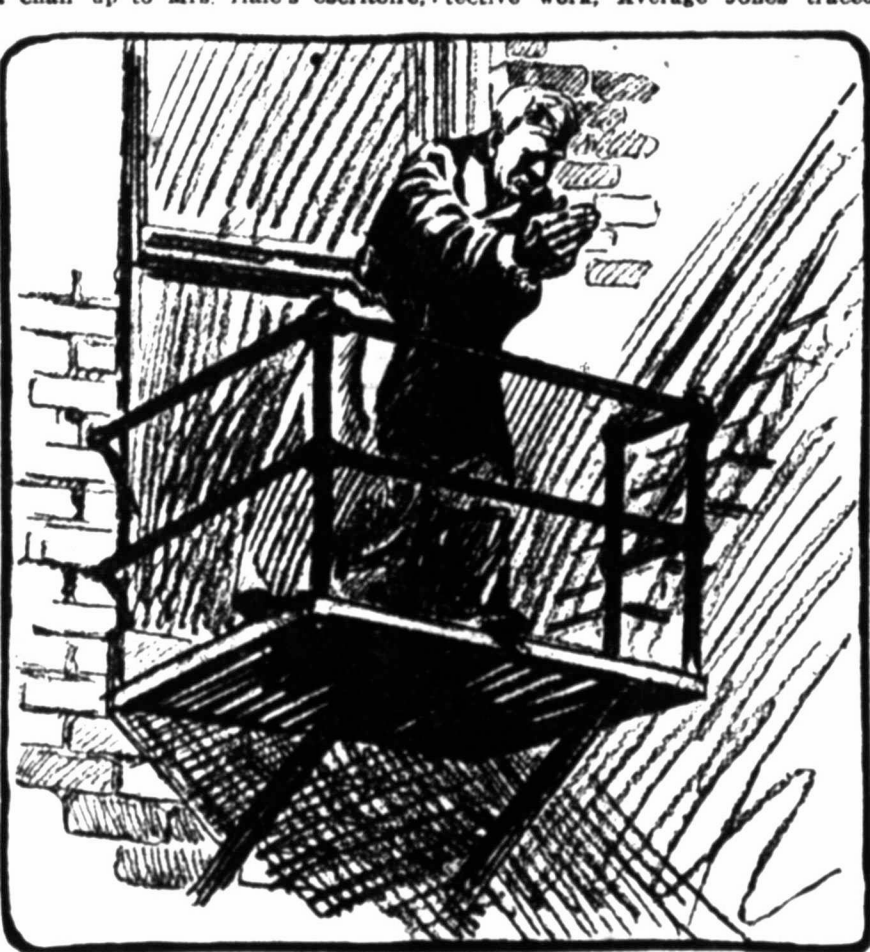
"Guy on the Third Floor Balcony."

just where, the finder couldn't remember. For the second a South Brooklyn pawnbroker demanded (and received) an exorbitant reward. A florist in Greenwich, Conn., contributed the last. With that patient attention The young man pondered, then drew to detail which is the A. B. C. of de-