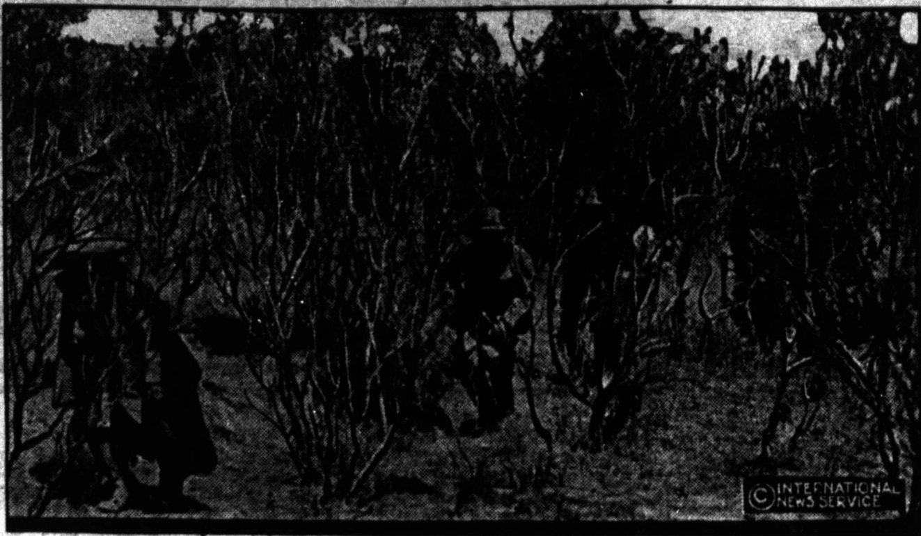
According to reports, Carranza believes his troops would be able to capture Vina if the job were left to them. Some of the Carranzistas are here seen on the trail of the bandits.

CARRANZA MEN TRAILING VILLA IN THE BRUSH