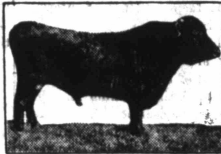
Splendid Type for Head of Dairy Herd.

The individual points of a good dairy sire cannot be given in detail here, but two of these will be mentioned, because they are in a sense, indispensable. The first is the evidences of much stamina and bodily vigor. The second is, an amplitude of soft skin