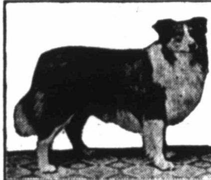
Splendid Sheep Dog.

Many years ago it was a practice in Texas to take a puppy from its dam before the eyes had opened and place it with a ewe, let her nurse it and allow the puppy to grow up with