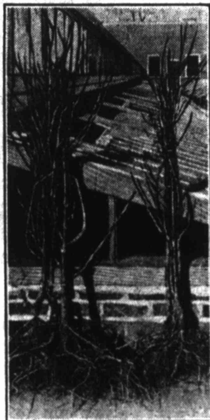
SOME PEACH NURSERY STOCK.

When peach trees are delivered from the nursery they should be unpacked immediately. Every possible precaution should be taken to prevent the roots from becoming dry. Unless the number of trees is so limited that immediate planting is possible the trees should be heeled in. A thoroughly well drained place, where the soil is mellow and deep, is required. A trench