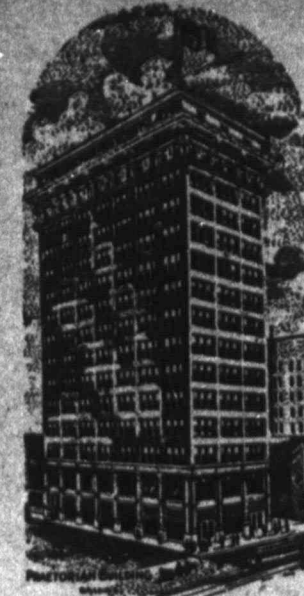
Praetorian Building Owned and Operated Exclusively by THE PRAETORIANS