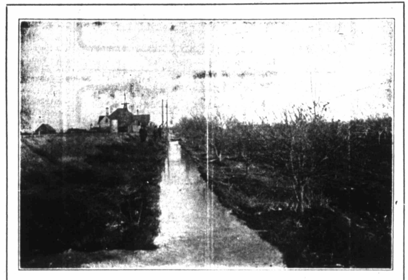
Irrigation Scene in the Portales Valley

We are cutting this Land Into any Size Tract to suit Purchaser and Will Sell on EASY TERMS to the Man who wants a Home. X