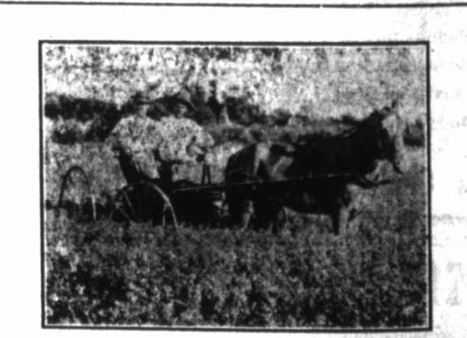
First Years Alfalfa Portales Valley