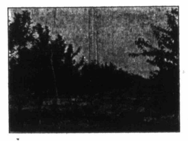
Young Orchard in the Portales Valley

We can sell you unimproved land or we can sell you inproved tracts or farms in any part of the Valley. Let us know your wants. We are in a position to help you. NO USE TO PAY RENT, Get you a Home, Start on the Road to Prosperity. Get Our Prices and Our Terms, and Get On An Irrigated Farm With Water Furnished If You Like and Go to Work on---