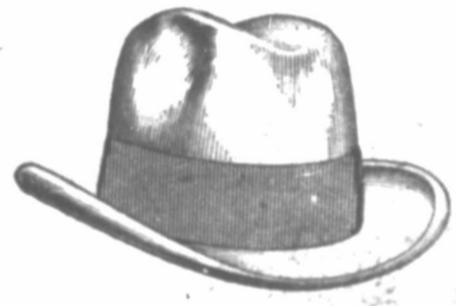
All the new Fall shapes all Colors and all grades.

Warren-Fooskee & Co. PORTALES THE HOME OF GOOD GOODS