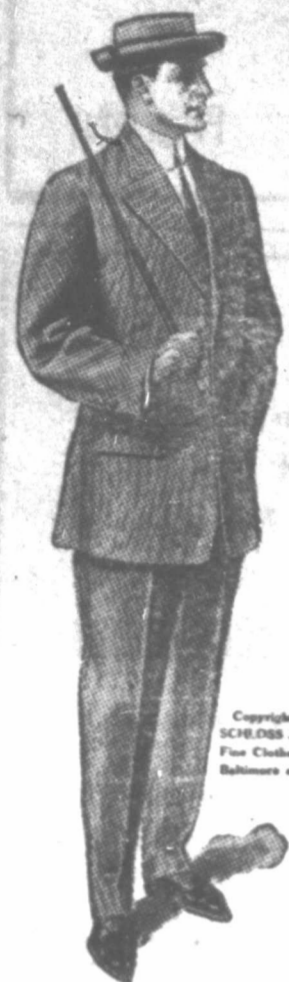
Copyright Schloss Bros. & Co. Five Cities Makers Baltimore and New York

Fall and Winter are almost at your doors--How about new fall Clothes? Do Not Delay! Buy Now while our stocks are Fresh and complete---Cold Weather will likely come without warning.