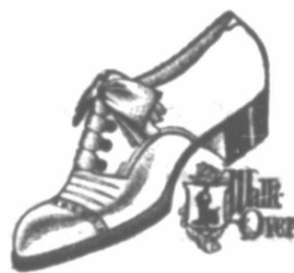
Walk Over Shoes in all the Nobby 1912 lasts. Price $3.50, $4.00, $4.50 and $5.00.

Men's Jerseys and Sweater coats All Sizes and Prices.