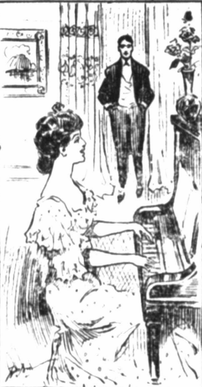
She was Alone and was Singing When Dennis Entered.

"As yet no one knows of this unfortunate loss. You are still considered an heiress, and are handsome enough to marry where you choose. I have here an invitation from the Courtlands for you to spend a month or so with them. They are wealthy and have but one child-an unmarried son.