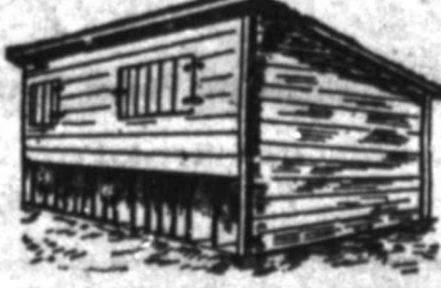
Fig. 2.-One Side of Self-Feeder.

I have found that hogs fed in this way will make money fast and easy. It is important, however, to keep good oats at one end and good shelled corn