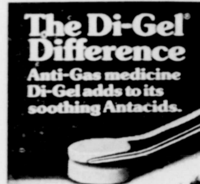
Di-Gel. The Anti-Gas Antacid.

A fine spirit of cooperation has always been in every transaction with the Buford Co-op Gin and we, the editors of this Review, wish to compliment them.