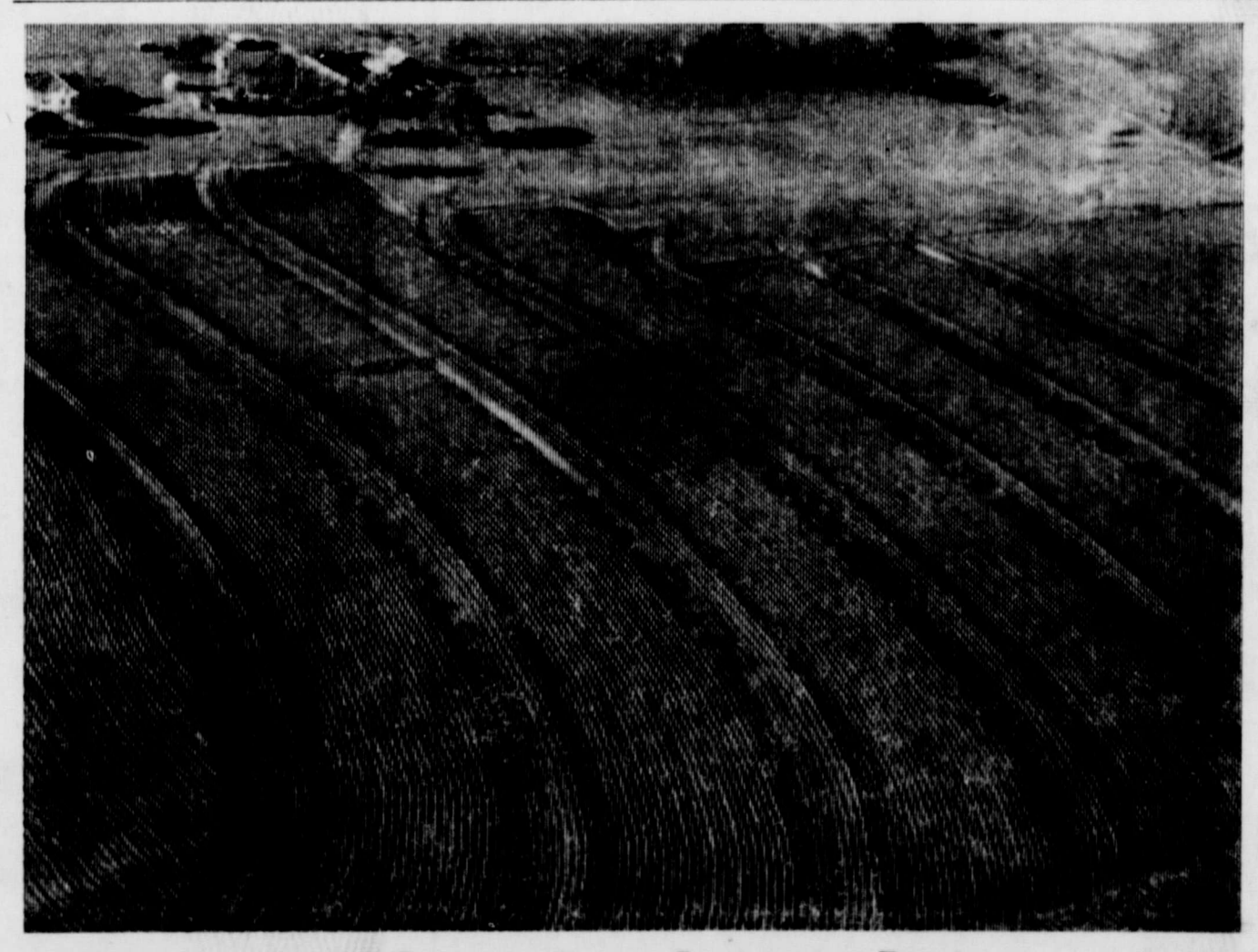
Parallel Terraces—A new Conservation Practice