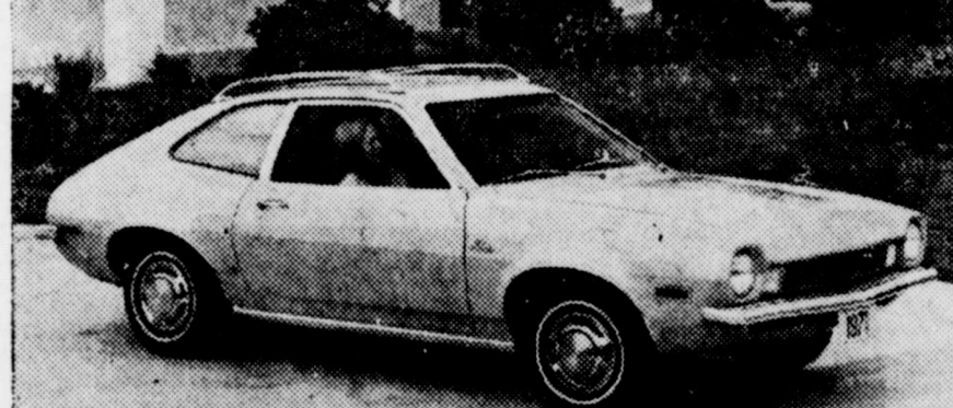
The Pinto 2 Door Sedan