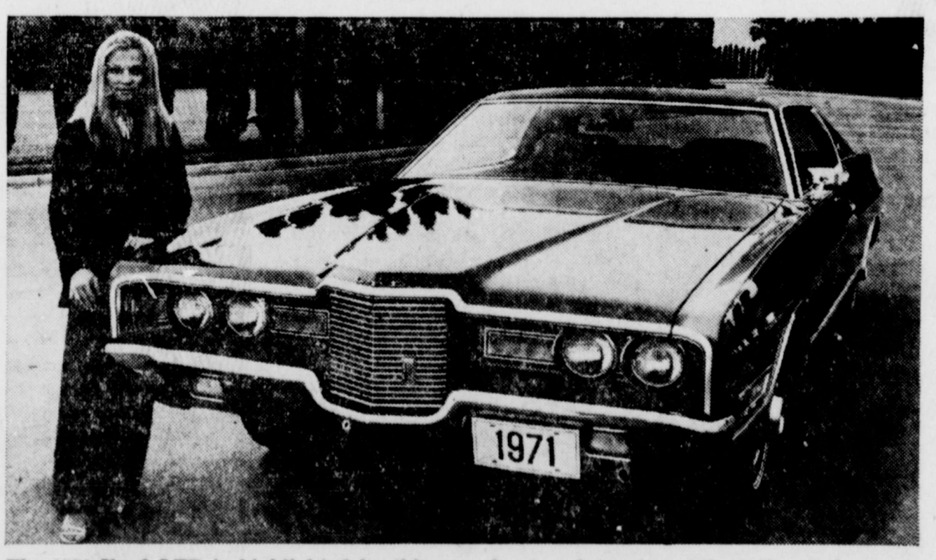
The 1971 Ford LTD is highlighted by this new front end treatment featuring a forwardthrusting center grille section and dual exposed headlamps. This LTD two-door Brougham includes a new, standard high back bench seat which eliminates the need for separate headrests. Ford's new side impact protection system, flush door handles, concealed windshield wipers and a new two-tiered, coved instrument panel also are standard features of the 1971 Ford.

"The action in '71 is bound to Continued on Back Page