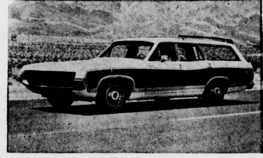
1971 Torino Squire