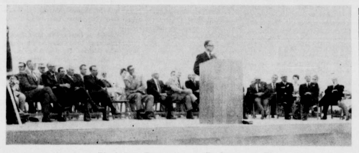
Speakers Platform, Congressman Burleson at Rostrum