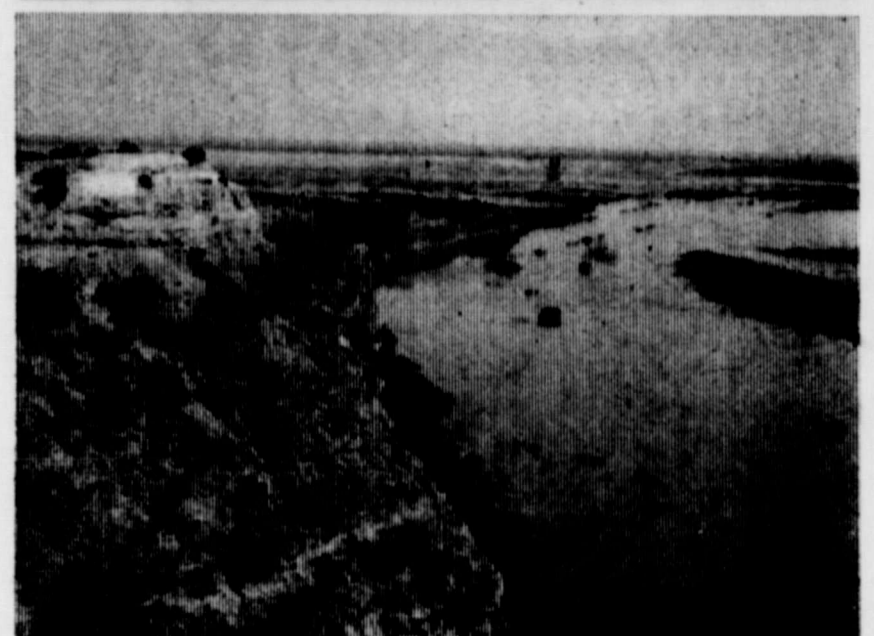
Recent Rains Put Water in Lake Spence