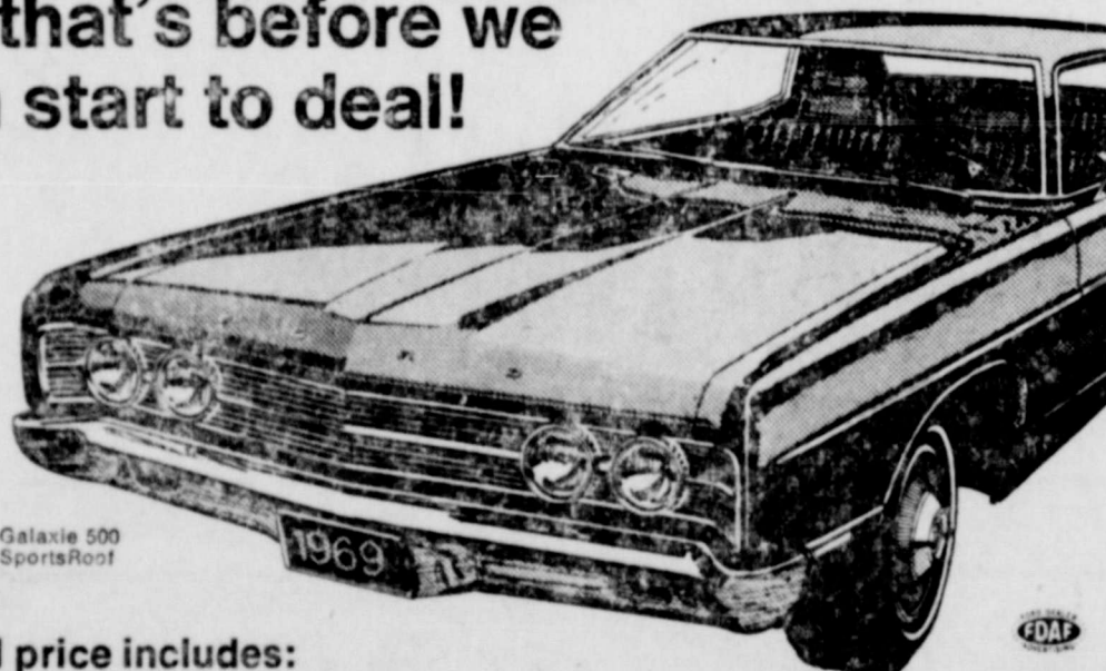
Galaxie 500 SportsRoof

And that's before we even start to deal!