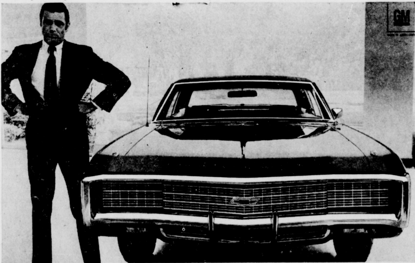
1969 Caprice Coupe

No clowns. No hoopla. No funny hats. This is an event for the serious car buyer. The man who has X number of dollars to spend and is determined to get his money's worth and maybe more. Come to a Chevrolet Showroom during our Value Showdown. Ask the man to show you, on paper, how you can order most any