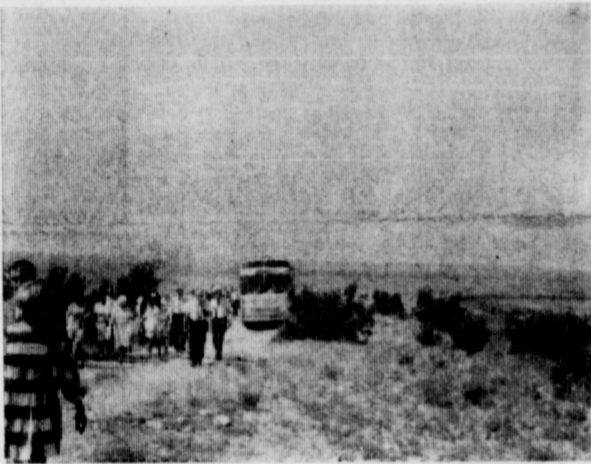
LEAVING THE DAMSITE—The crowd which gathered at the tip of the observation area northwest of Robert Lee return

The Texas Forts Trail goes through Coke County southwest and northeast direction. It comes into the county on Highway 208 south of Robert Lee, then covers Highway 158 to Bronte, and proceeds from there along Highway 277 to the Runnels County line east of Fort Chadbourne.