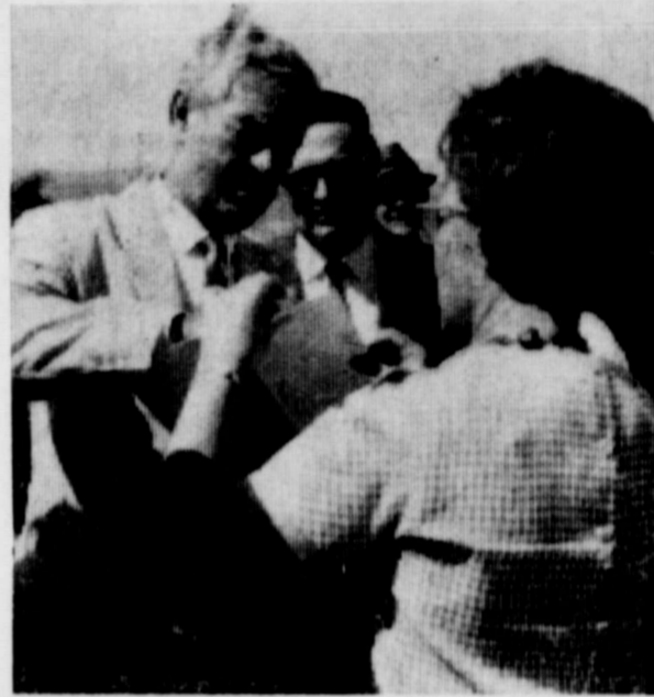
AUTOGRAPH PARTY — Governor Connally autographs one of the placards which was carried by an honor guard