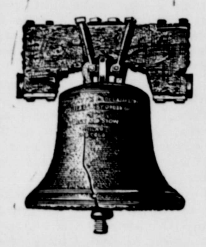
Buy U.S. Savings Bonds Now Pay 4.15% To Maturity