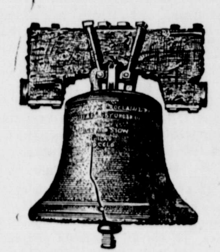
Buy U.S. Savings Bonds Now Pay 4.15% To Maturity

We're Not inquisitive But . . . Your Neighbors Always Like to Know