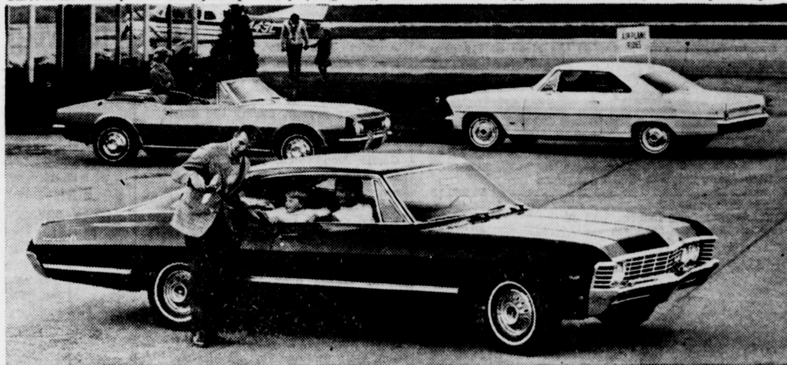
Three of the best buys in town! Impala Sport Coupe (foreground), Camaro Convertible (upper left) and the Chevy II Nova Sport Coupe.

You've made Chevrolet even more popular!