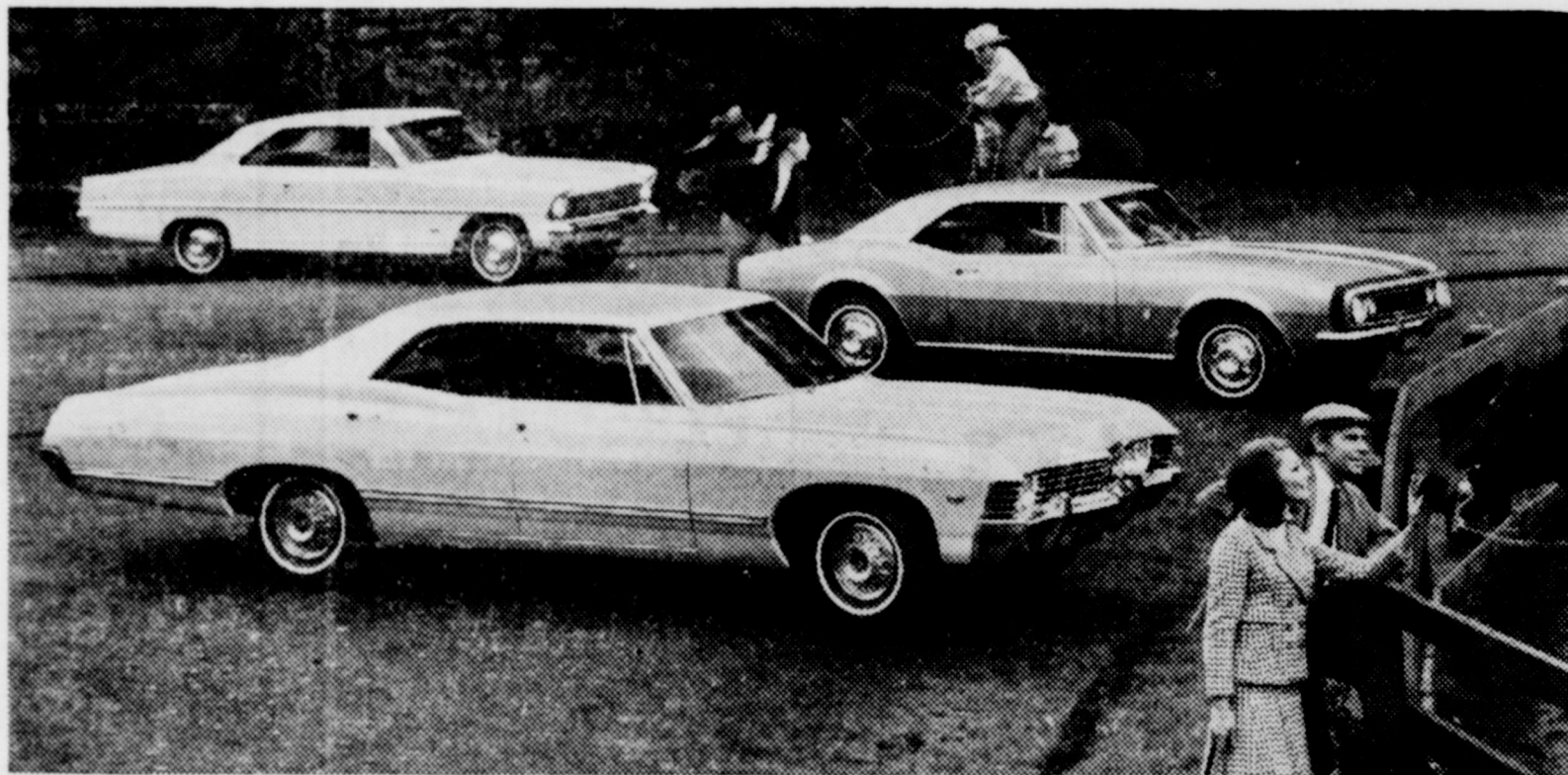
Top left: Chevy II Nova Sport Coupe. Foreground: Chevrolet Impala Sport Sedan. Top right: Camaro Sport Coupe.

is proud to have a part in helping the Robert Lee Area of the new lake grow. Serving in the lake vicinity, the cooperative will be glad to help in any way to secure their needs in the electrical service to cabins or commercial establishments.