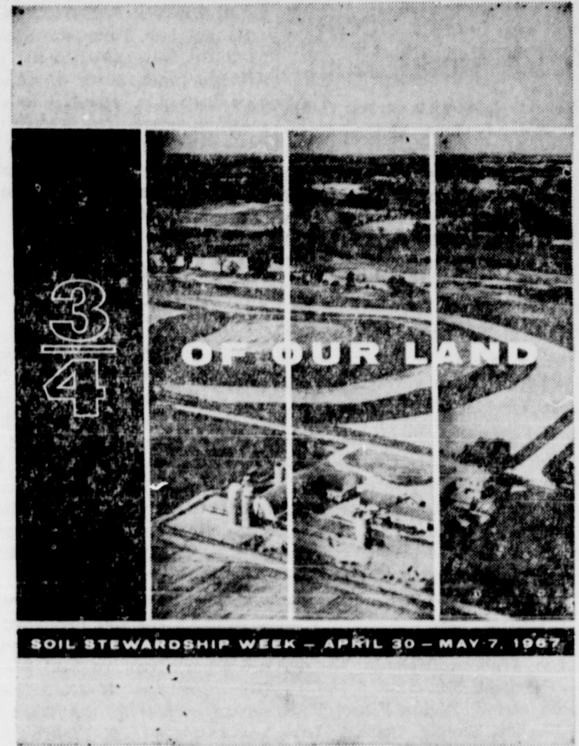
SOIL STEWARDSHIP WEEK - APRIL 30 - MAY 7, 1967

Holders of Postal Savings certificates can arrange to redeem them simply by applying at the post office where the certificates were issued.