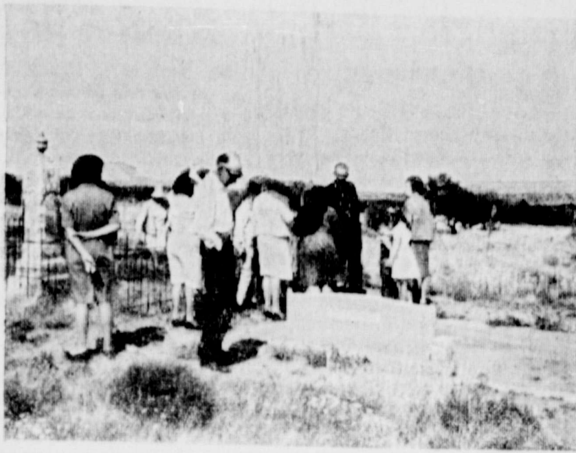
TOUR AT HAYRICK —The historical tour of part of Coke County took local and visiting persons to the Hayrick Cemetery Sunday afternoon. Hayrick was first county seat of Coke County.