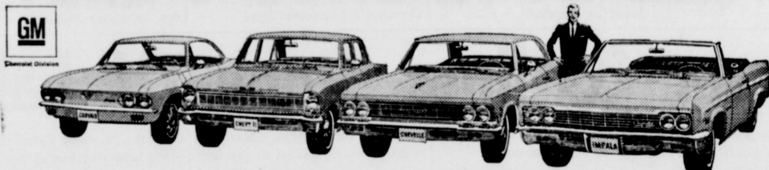
Left to right: Corvair Monza Sport Coupe, Chevy II Nova 4-Door Sedan, Chevelle Malibu Sport Coupe and Chevrolet Impala Convertible. Each comes with an outside rearview mirror and seven other standard features for your added safety. Always check your mirror before you pass.

That's the beauty of buying America's most popular make of car—especially right now when summer savings are extra tempting. It just makes sense that you're going to save in a big way by seeing the man who's doing business in a big way. So go see what