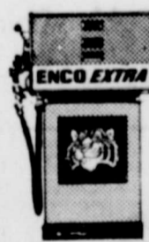
Here's that Tiger.

You're a skeptic. Good. Then you're going to be a good customer, if we can ever win you. We showed you proof on television that High-energy Enco Extra cleans your carburetor while you drive.