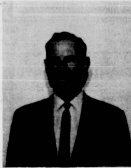
Judge W. W. Thetford