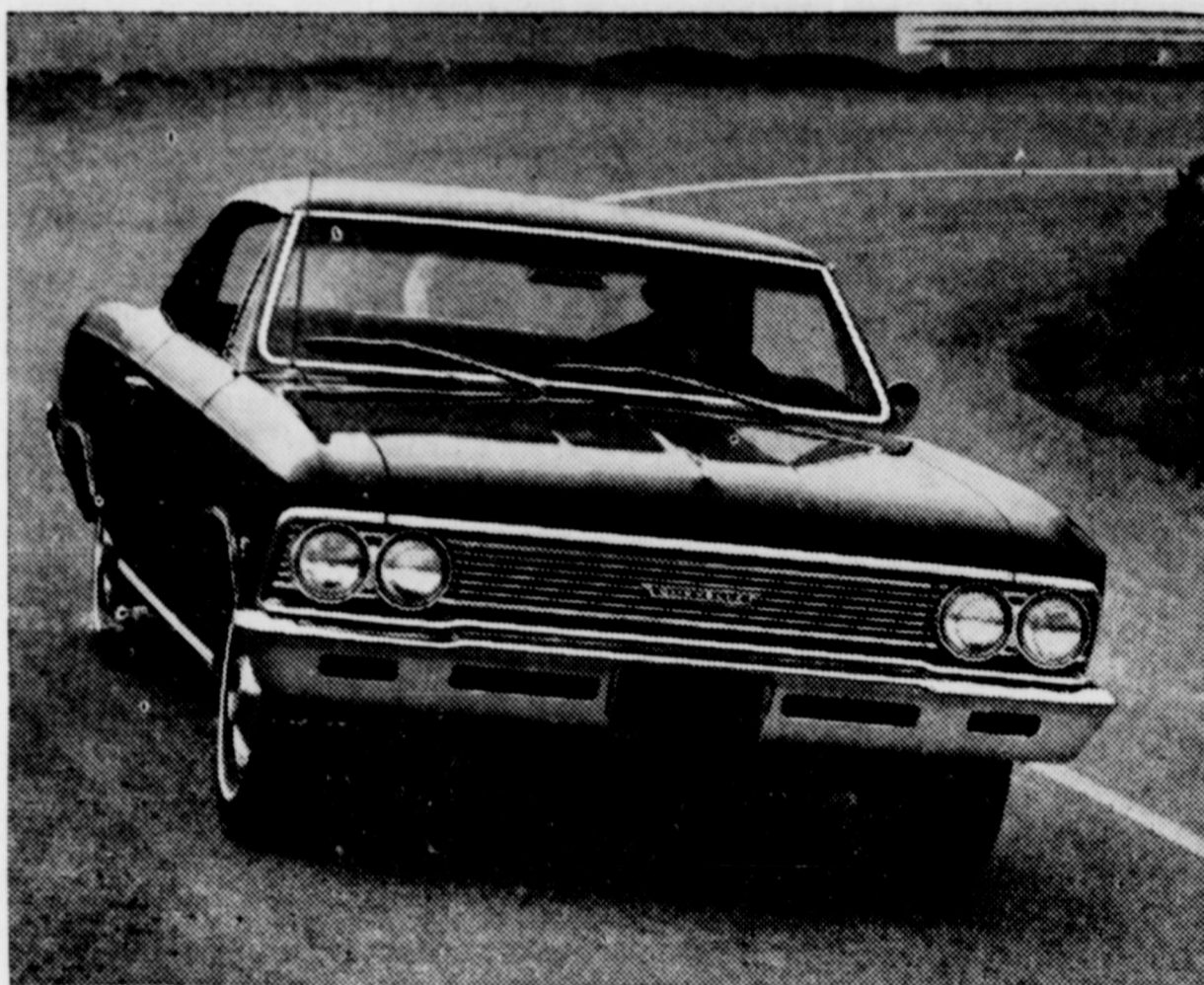
Chevelle Malibu Sport Coupe—with eight new standard safety features, including outside rearview mirror and shatter-resistant inside mirror. Always check both mirrors before pulling out to pass.

The way people are snapping up buys on new Chevelle V8's at your Chevrolet dealer's... you'd think they're really getting away with something.