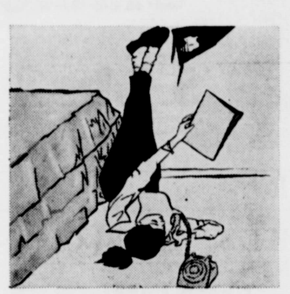
ANOTHER TELEPHONE FOR TEEN-AGERS