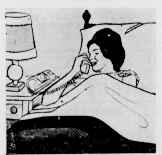
ANOTHER TELEPHONE IN THE BEDROOM

A telephone wherever you are in your home . . . this is modern living at its best . . . for you don't have to run when you have more than one! There's no need to waste time and energy when it's so easy to have additional phones in the living room, bedroom, kitchen, den or family room. Costs so little, too, just a few cents a day for this modern convenience. Choose a desk phone, wall phone, Spacemaker or the new Starlite®, in decorator colors to harmonize with any room. You've wanted additional phones for a long time, in one or more places in your home. Begin to live modern during ADD-A-PHONE MONTH. Just ask any General Telephone employee or call the Business Office. Do it today . . . NOW!