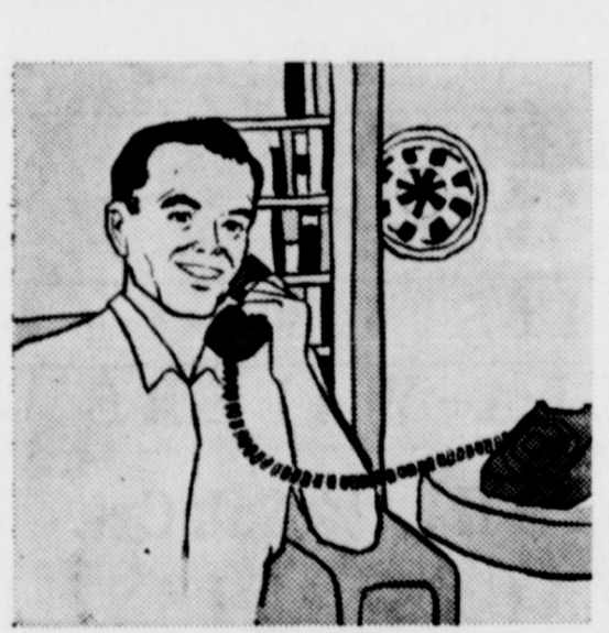
ANOTHER TELEPHONE IN THE DEN