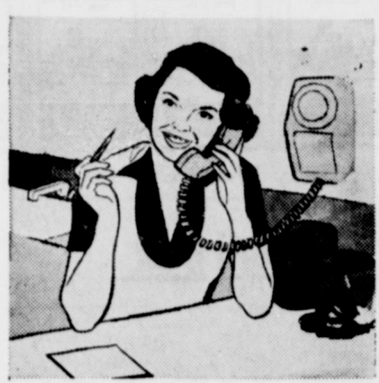
ANOTHER TELEPHONE IN THE KITCHEN