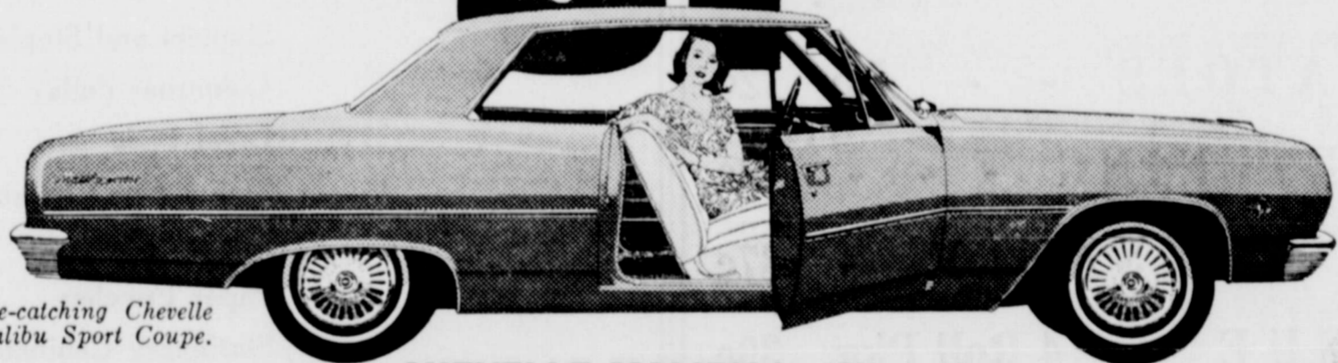
Eye-catching Chevelle Malibu Sport Coupe.