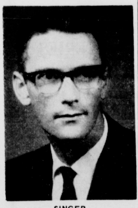
SINGER FREDDY FRANKS