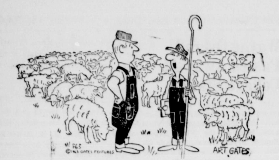
"I know I'm supposed to count them ... but I keep falling asleep!"