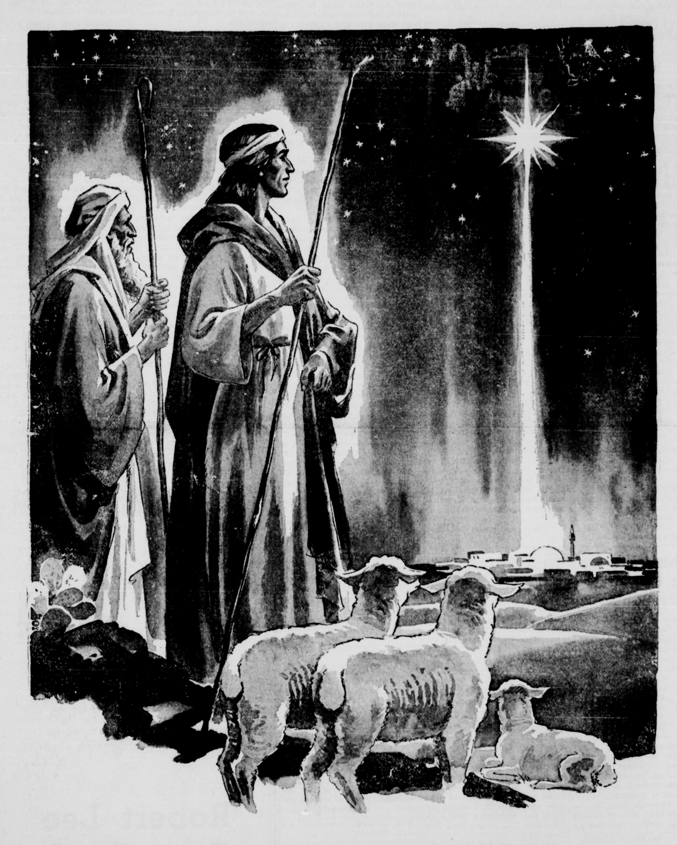
O, little town of Bethlehem, how still we see thee lie! Above thy deep and dreamless sleep the silent stars go by; Yet in thy dark streets shineth the everlasting light! The hopes and fears of all the years are met in thee tonight.