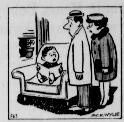
"The baby sitter got nasty so I fired her!"